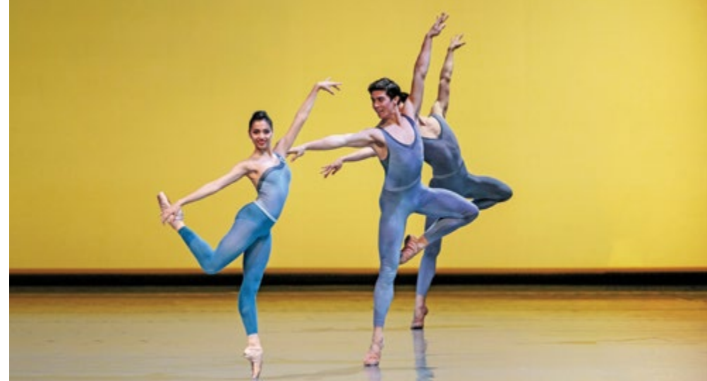
San Francisco Ballet in Tomasson's The Fifth Season

The West Coast premiere of Alexei Ratmanský's The Seasons , co-commissioned with American Ballet Theatre, reimagines a lost ballet by Marius Petipa with fiendishly challenging choreography, a cast of creative characters and colorful costumes, and a Alexander Glazunov score. Bournonville's Romantic-era fairytale classic La Sylphide tells the tragic love story of James, a Scotsman who falls in love with a sylph, an ethereal woodland sprite, and features both a poignant story and brilliant dancing.