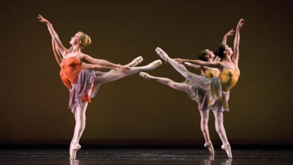
San Francisco Ballet in Tomasson's Prism