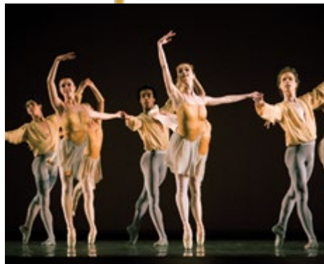
San Francisco Ballet in Tomasson's Prism