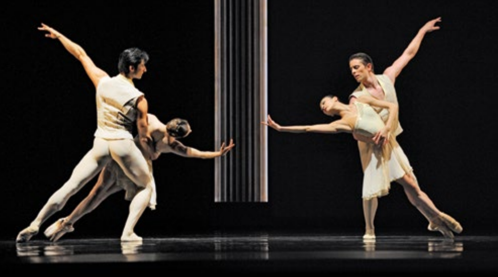
San Francisco Ballet in Tomasson's Caprice