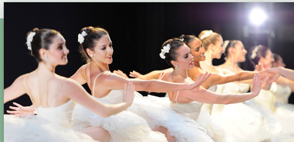
San Francisco Ballet in Balanchine's Symphony In C // Choreography by George Balanchine © The Balanchine Trust