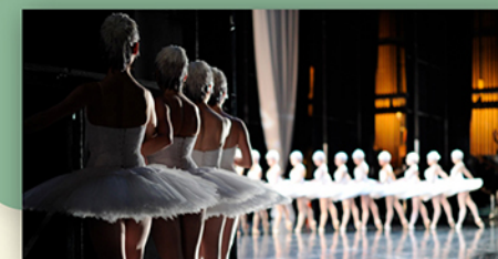
San Francisco Ballet backstage during a performance of Tomasson's Swan Lake

*We are hopeful that by February 2022 there will be more flexibility with capacity and are therefore renewing subscribers into their regular seats. If this is not the case, we will be in touch with you to discuss your options.