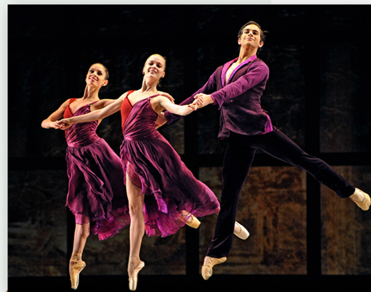
San Francisco Ballet in Tomasson's Trio

The West Coast premiere of Alexei Ratmanský's The Seasons , which reimagines a lost ballet by Marius Petipa with fiendishly challenging choreography and creative characters, follows Bournonville's Romantic-era fairytale classic La Sylphide in a program built for ballet lovers.